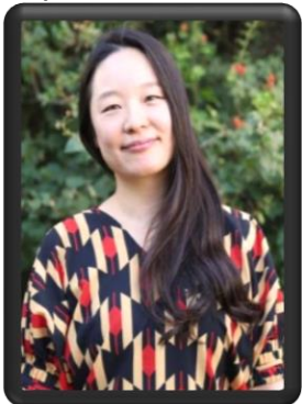
yangyang (South Korea, USA)