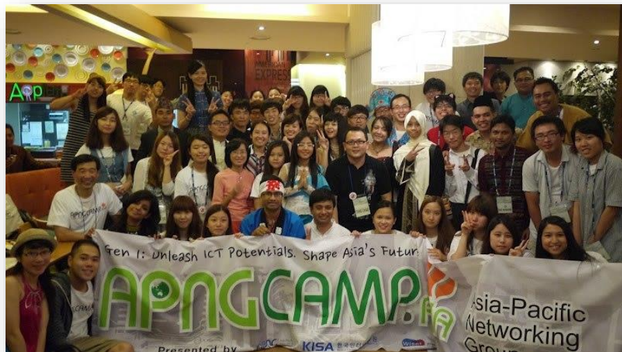
@ 14 th Camp, Seoul, Korea