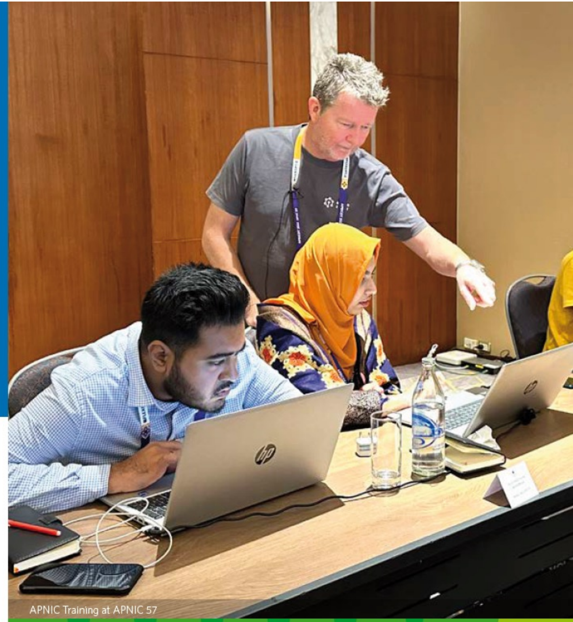
APNIC Training at APNIC 57