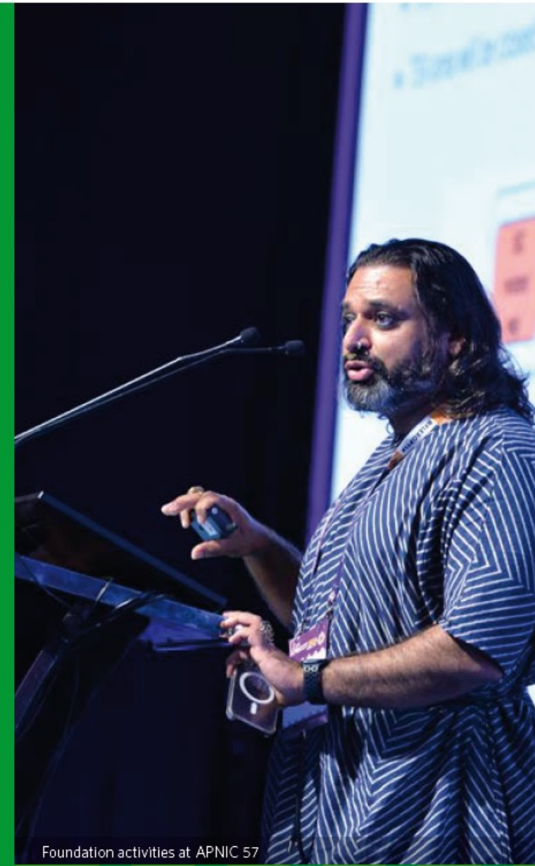
Foundation activities at APNIC 57

16 FOUNDATION COMMUNITY ASSISTANCE INITIATIVES