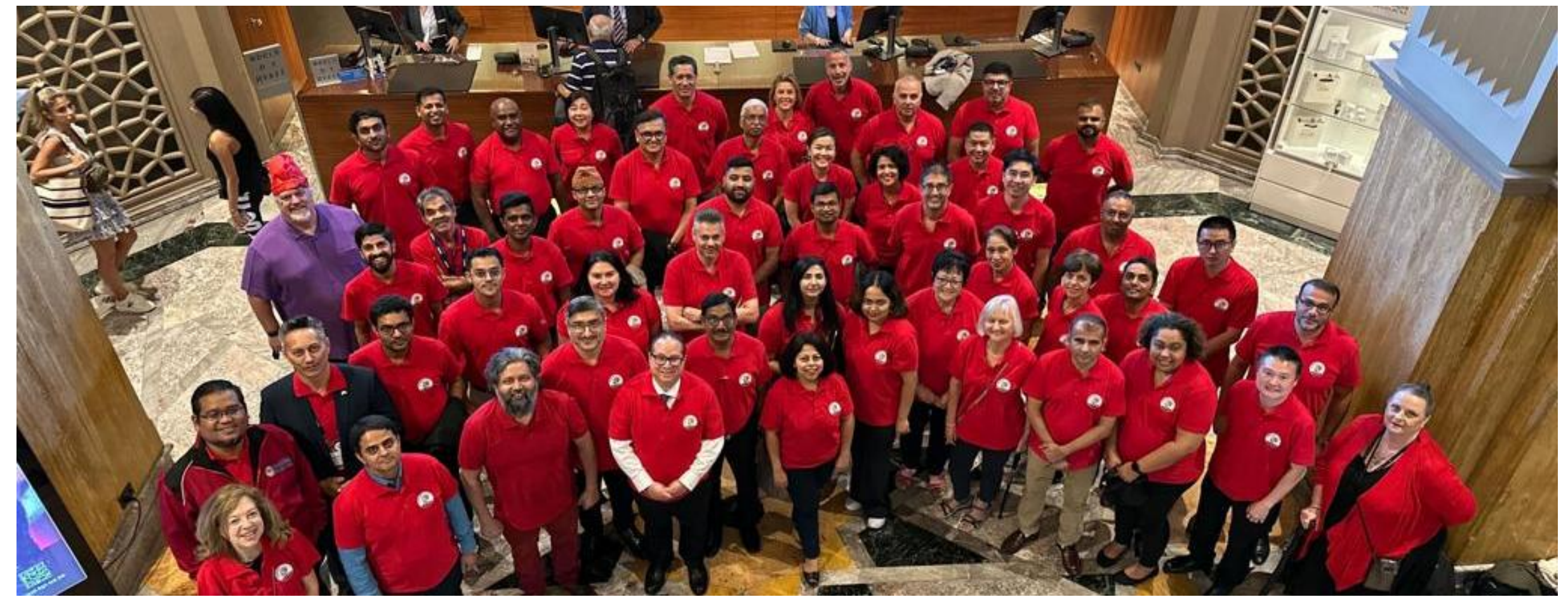
A community comprising 69 At-Large Structures (ALSes) and 45 Individual Members (IMs) in 35 countries and territories, as well as non-member participants